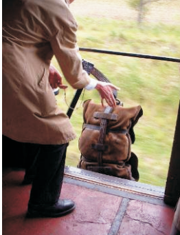
Setting out a pouch for pickup at about 100kph

One aspect of the TPOs that has always caught the imagination is the high speed pickup and drop-off of mail. Actually that had to stop in the '70s when trains speeds increased to the extent that risk of damage to the mail became likely. Enthusiast groups in England have restored mail coaches and the pickup/dropoff apparatus. It seems that about one bag in fifteen or so misses the collecting net and can end up just about anywhere!