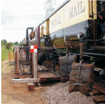
One pouch caught – two to go. Three yet to be collected

of the special cars in use in the final days. While 3,000 letters an hour can be sorted on the overnight trains, automated equipment is now capable of handling 30,000 per hour. The decision to transport mail solely by air and road means the end to the "Victorian solution to a Victorian problem" of moving post around the country. The move will save Royal Mail $20m a year. Staff members, past and present, as well as postal and railway enthusiasts, accept the demise of this service with fond memories and deep regret.