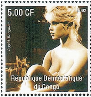
Easy mistake: confusing Brigitte Bardot with Ingrid Bergman.

An expensive Swedish collection was among the stamps burnt, according to the collector, who is now threatening to burn the stamps of any country whose media insult the prophet Mohammed. He is now apparently busy sorting through his collection in readiness.