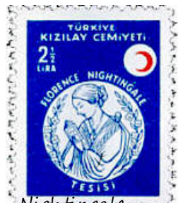
Nightingale was honoured with a set of stamps from Turkey where a museum at

After Inkerman she was given the task of arranging the Barracks Hospital system at Scutari. Military leaders felt Florence's comments about conditions were attacks against them