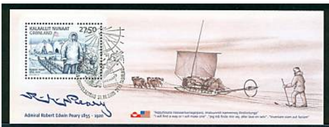
Admiral Peary was honoured on this Greenland souvenir sheet for his

Although there was only 133 miles between the ship and the Pole it was still a major production to reach their goal. This was the third time the Captain escorted Peary and his crew for (On the Cover continued on page 3 )