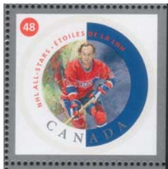
NHL All Stars 3