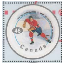
NHL All Stars 2