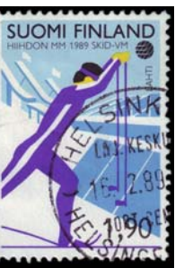
Cross-country skiing, the first skiing style is

The people of Norway have a central role in the early development of both the ski and skiing. Ski makers in Telemark province in Norway created the first ski with 'camber' around 1850. Camber is the slight upward bulge of the ski's center that can be seen when not in use. It allows for more even distribution of a skier's weight over the length of the ski providing the skier with a better glide through the snow and better control.