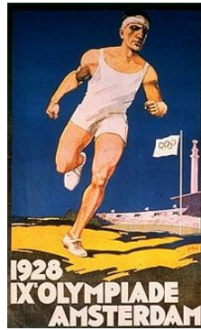
The official poster for the 1928 Dutch