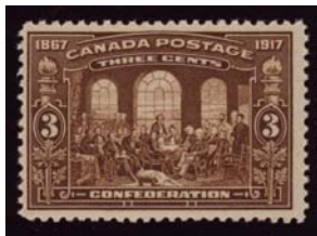
3¢ 1917 - Engraved by Edwin Gunn Eight Fathers of Confederation were omitted

Robert Harris (1848-1919) Harris was commissioned to paint the Fathers of Confederation in 1883 and the finished work was installed in the Centre Block of the Parliament Buildings the following year. The agreed price for the work was $4,000. Tragically, the painting was a casualty when the Centre Block burned in February 1916. It showed the delegates in session at the Charlottetown and Quebec Conferences of 1864.