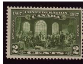
2¢ 1927 - Engraved by Edwin Gunn The eight missing delegates have been restored as on the original painting