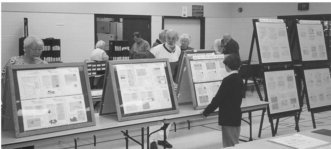
The exhibition at the OSSC's 5 th Annual Show and Bourse.