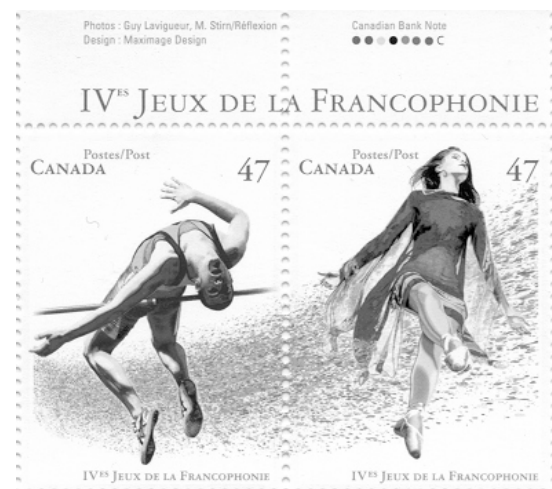
The pair of stamps marking the 4th Games of La Francophonie – a unique combination of sporting and cultural competition with athletes and artists from more than 50 French speaking countries.