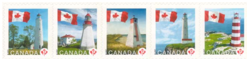
Point Clark, ON. Pachena Point, BC Warren Landing, MA Cap-des-