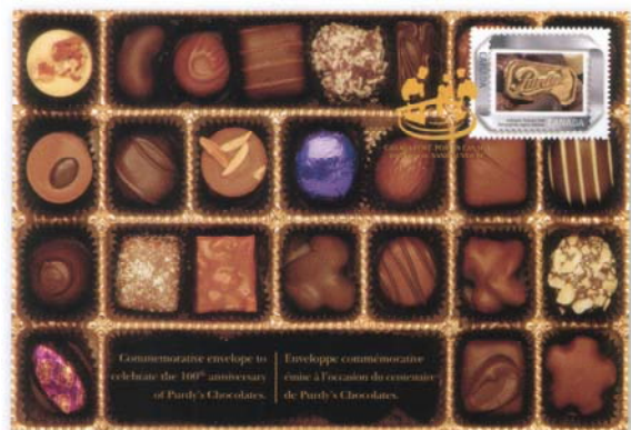
This commemorative envelope issued on Feb. 8 2007 to celebrate 100 years of Purdy's Chocolates was sold out by spring.

Today, cocoa is grown in most of the tropical regions of the world. Up to 90% of the cocoa supply is grown by subsistence farmers with landholdings of less than 10 hectares. A group of 8 countries provide 90% of the world's 3 million tones of annual production. West Africa is by far the largest producer with the Ivory Coast alone providing almost 40% of the world supply.