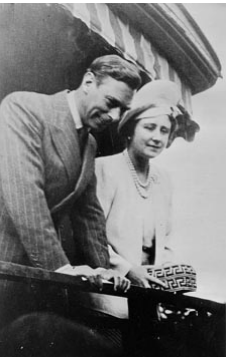
The King & Queen greet Canadians from

The ground had to be prepared for such a huge sculpture. Steel columns set into bedrock support a huge footing of reinforced concrete.