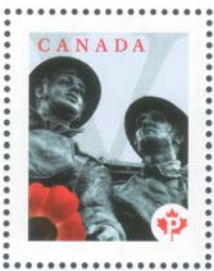
The new 'Lest We Forget'